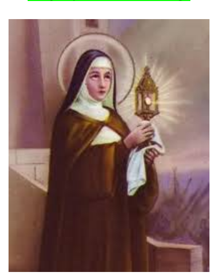
Display the following.

Saint of the Day - Saint Clare of Assisi (1194-1253); Feast Day August 11th; Patron of Television & Computer Screens (Student guide pg 29)